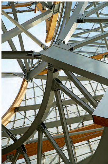
The roof support structure is made of wood, steel and duplex stainless steel components.

In the beginning, the challenges facing the project teams – designing such highly complex volumes and shapes, solving stability problems, fabricating and connecting the building elements, preparing detailed implementation plans, working out lifting and assembly schedules for every element of such a giant puzzle – were believed to be impossible to overcome. But the architect had already solved these problems. For the Bilbao Guggenheim museum, Gehry Technologies created a software package called Digital Project. Based on Dassault Systems' CATIA software for designing complex aerospace parts, they expanded it into an integrated collaborative platform. All project partners were required to use this tool along with a common 3D model in order to allow close collaboration between R&D, prototyping, fabrication and building phases of the project. This tightly controlled approach produced exceptional project performance that avoided discrepancies or delay,