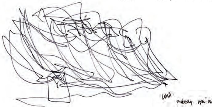
Frank Gehry's spontaneous preliminary sketch for the museum. © Gehry Partners, LLP and Frank O. Gehry.

If one specific characteristic defines Frank Gehry's style, it is undoubtedly his disdain for the straight line! Most of his works show an affinity for fluid forms, curves and counter-curves enhanced with glass walls, or twisted metal sheets placed on undulating facades. Arnaud, in awe of the architect's Bilbao Guggenheim Museum, was eager to present the City of Light with a prestigious showcase for his own contemporary collection, along with commissioned works, guest artists and temporary exhibitions. Gehry's initial sketch for Arnaud used an almost unbroken line, imagining a vessel with billowing transparent sails. He acknowledges the influence of 19 th -century iconic parisian glass pavilions >