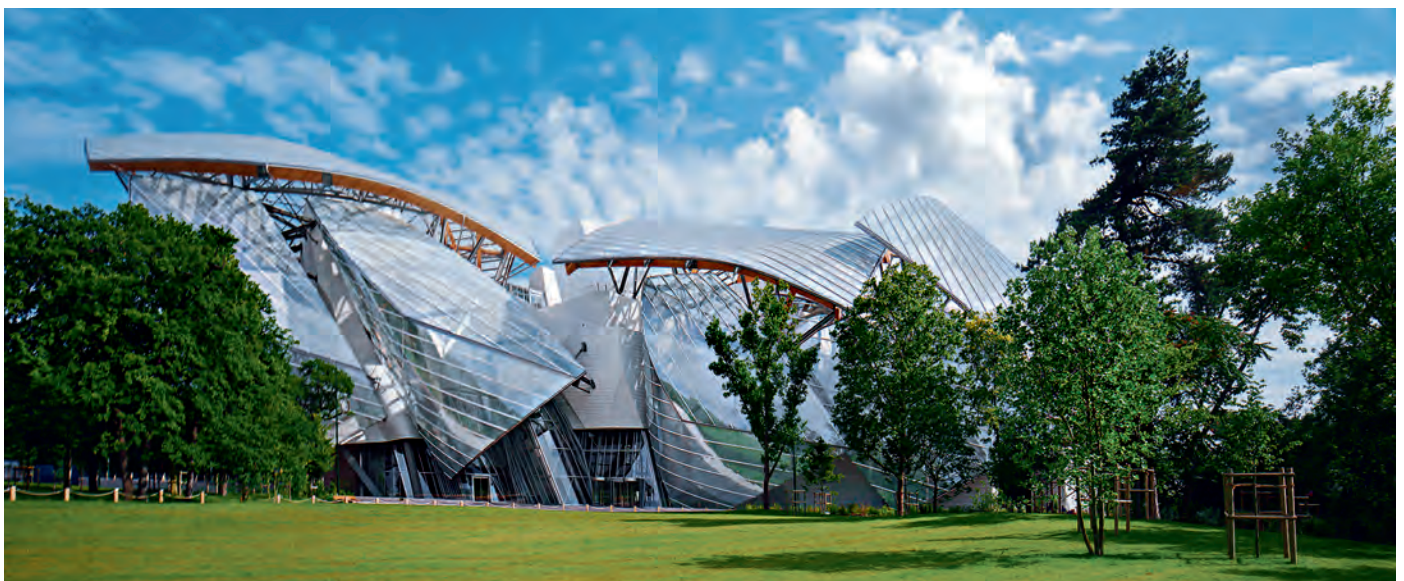
"To reflect our constantly changing world, we wanted to create a building that would evolve according to the time and the light in order to give the impression of something ephemeral and continually changing." Frank Gehry.