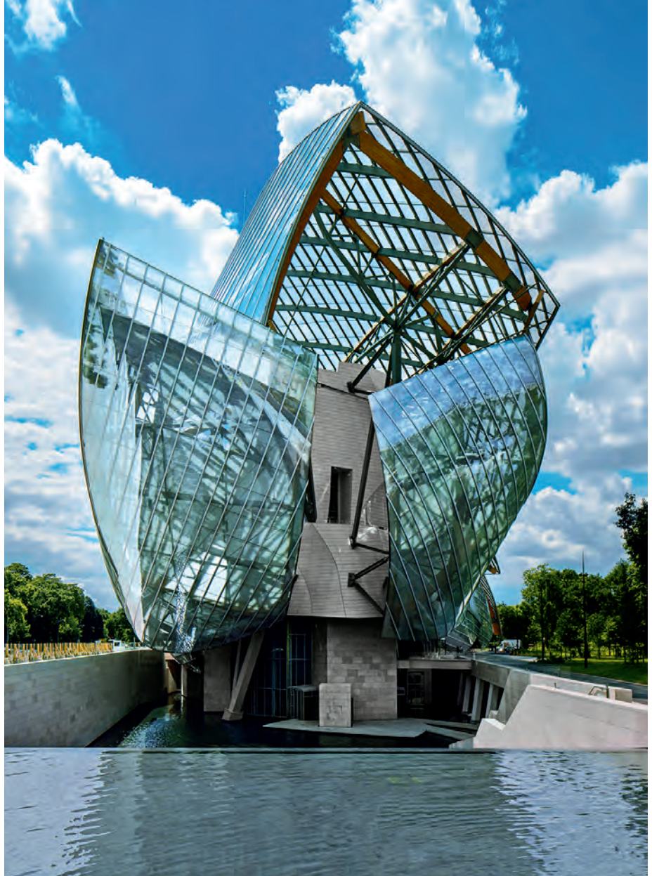
With its glass sails and the water features throughout, the new museum resembles a ship sailing above the Bois de Boulogne.

Eiffage, the main contractor for the large sails, worked closely with the supplier of the fabricated duplex stainless steel parts ThyssenKrupp Materials France (TKMF). Fabrication of the various components demanded attention to detail and precision. In order to avoid deformation due to heating and to comply with the tight flatness tolerances, TKMF acquired specialized high-pressure water-jet equipment to cut the components. The cutting process is so slow that it required two years of continuous day and night shifts on the new machine to prepare all pieces. Because of the great variation in dimensions and curvature,