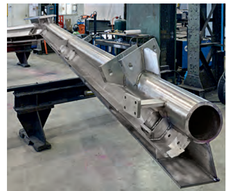
Straight or curved, duplex gutters are fitted with fixing "ears" and mounting plates.

Protection of art works was an important criterion for the choice of the indoor piping materials. In rooms where leaks could damage exhibits, pipes are made of welded Type 316L stainless steel and sound-insulated with glass-wool sleeves. This approach was chosen over traditional PVC piping with solvent-cemented connections that were deemed less reliable. For some indoor water piping, stainless steel and aluminum pipes are connected with flanges.